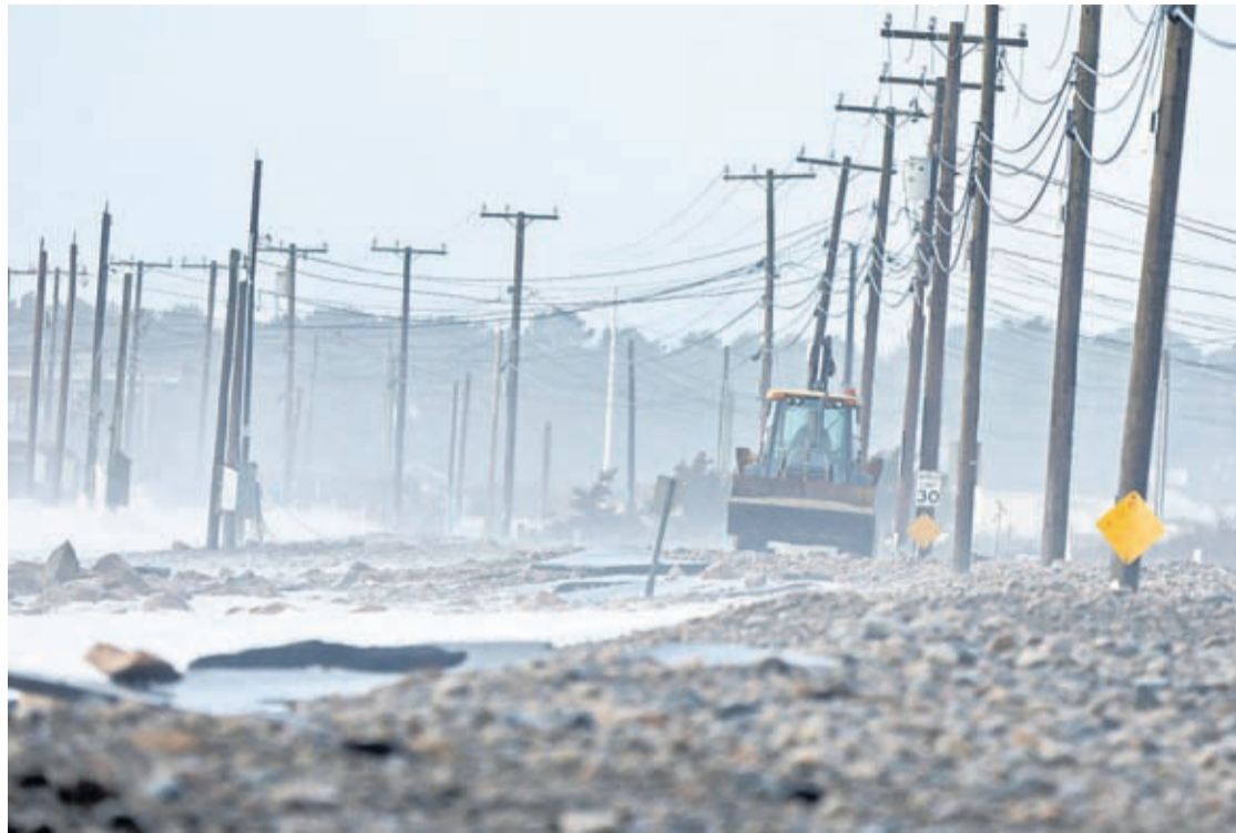
The remnants of East Beach Road are damaged after heavy overnight winds and surf battered the coastline, Wednesday, Jan. 10, 2024 in Westport, Mass.

The Salisbury Beach Citizens for Change group, which facilitated the project and helped raise funds, posted on social media about the project's completion last week and then again after the storm. They argued the project still was worthwhile, noting that "the sacrificial dunes did their job" and protected some properties from being "eaten up" by the storm. It's the latest round of severe storms in the community and across Massachusetts, which already suffered flooding,